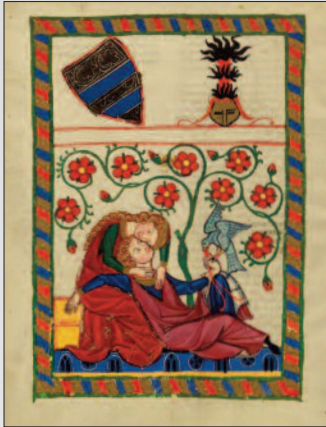
Exhibit of the Codex Manesse: The Discovery of Love

To mark the 625 th anniversary of Heidelberg University, the University Library will put on display one of the most significant manuscripts of the Middle Ages, the 14 th -century Codex Manesse. The exhibit, entitled “The Codex Manesse and the Discovery of Love”, will open on 25 October 2010 . Visitors will be able to view the magnificent collection of songs and verses in Middle High German, which rarely leaves the air-conditioned environs of the library’s vault, until 20 February 2011 . The Codex Manesse is part of the renowned Bibliotheca Palatina which ended up in Vatican hands in the wake of the 30 Years’ War. An exhibit at the Bibliotheca Palatina was the cultural high point of the university’s anniversary celebration in 1986. The opening ceremony in the Great Hall of the Old University starts at 6:00 p.m.